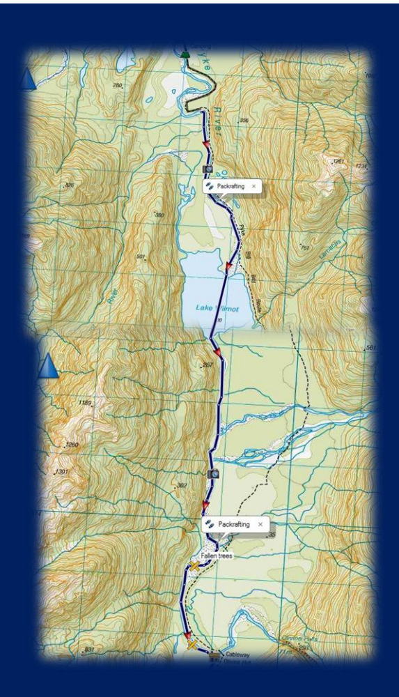
DAY 8: OLIVINE HUT – ALABASTER HUT